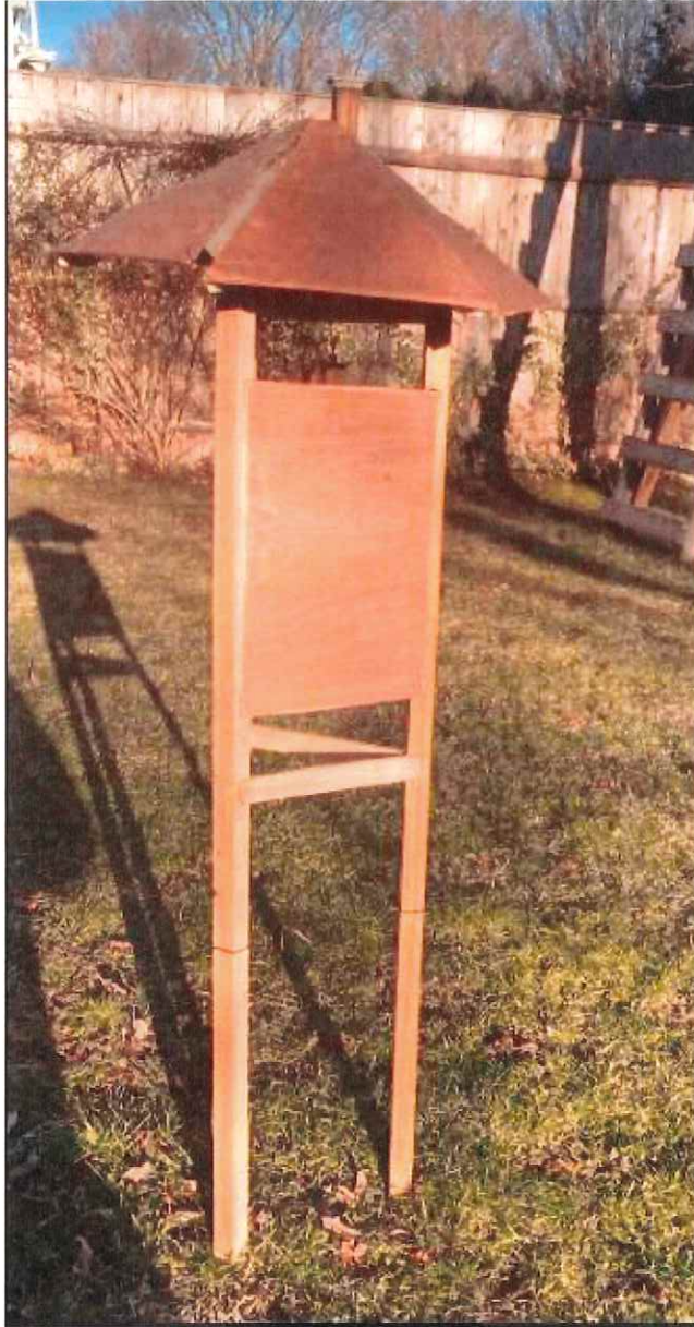
Fig. 3: \frac{1}{4} -scale model of proposed informational kiosk, based on CAD model in Fig. 2 (black line on support posts shows location of ground level; actual kiosk posts will extend four feet below ground level)